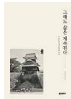
“But Life Goes On” KRW13, 800 (JPY1,367)

Civic Force organized the “Tour for Tourism Reconstruction Supporting Volunteers” for students of the Tohoku region and South Korea, which was a one-week training program to visit the disaster-affected areas of Kumamoto. The interaction between these Japanese and Korean students still continues one year after the tour and this May, seven Korean students published a book titled “But Life goes On.” This is a photo essay featuring photos of the areas that suffered from the Kumamoto Earthquake or the Northern Kyushu Torrential Rain where they visited through the program, as well as essays that describe the wishes for restoration of the people they met and what they felt on site. The book is available at book shops in Daejeon-Gwangyeoksi, Korea or can be purchased on the internet.