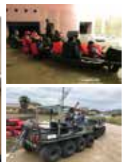
View of Okayama Prefecture from the sky, and a rescue operation at a heliport