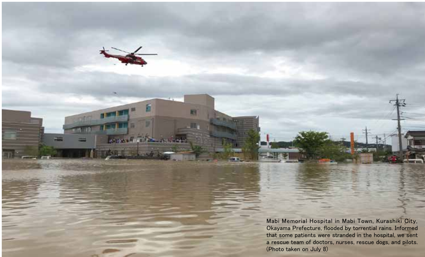
Mabi Memorial Hospital in Mabi Town, Kurashiki City, Okayama Prefecture, flooded by torrential rains. Informed that some patients were stranded in the hospital, we sent a rescue team of doctors, nurses, rescue dogs, and pilots. (Photo taken on July 8)