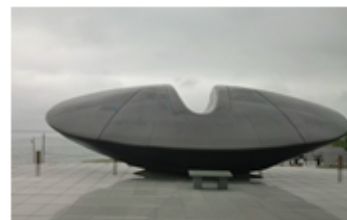
Memorial “Jikusho” (Okushiri Island)

Strategy for tourism after the disaster and for the future of community 10 years and 20 years from now. Civic Force is continuing to cooperate with people in disaster areas and to support reconstruction and community development for the future.