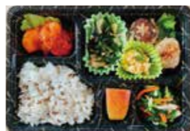
Nourishing boxed lunch with protein-rich meat and seasonal vegetables.

Riku Café of Rikuzentakata City, Iwate Prefecture is also an NPO working to regenerate communities that were broken up and lost by the disaster. As part of the activities supporting healthy lives, this group has been putting much effort to fostering the "power to live" to young generations bearing the future. The NPO hosted a recipe competition at Takata High School in February 2024 and held three sessions selling boxed lunches with the prize-winning recipes. These lunches were well-received as being filling but healthy. One of the students who created the recipe hopes to have a job related to food.