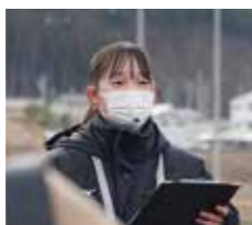
A high school student of Kamaishi City talks about the Great East Japan Earthquake.

"Bosai Kizuna Gakuen" is a team mainly founded by a voluntary group, "Yumedan," of Kamaishi High School in Iwate Prefecture that was affected by the earthquake in 2011, and a disaster prevention team, "Genkai," of Kamakura City in Kanagawa Prefecture. Although the young members did not live through the disaster and live in different locations, the team has been working on various initiatives to raise disaster prevention awareness. At the "Sendai Bosai Mirai Forum 2024," an annual disaster prevention event held on March 9 in Miyagi Prefecture, the team introduced an original card game which is being co-developed and emphasizes the importance of disaster reduction. The next day, the team held a story-telling event at Unosumai Stadium where a rugby match was held to support recovery. Many people listened attentively to the high school student who debuted as a storyteller who was determined to "pass down my family's memories of the disaster even though these memories are not my own."