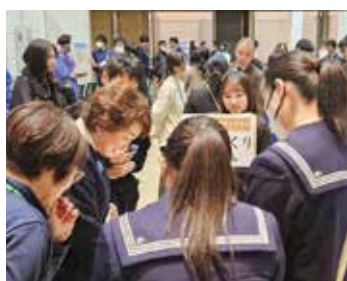
Introduces a disaster management card game, Bosai Bozumekuri.